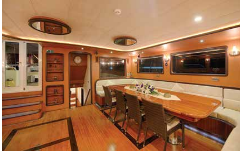
Queen of Salmakis SALOON